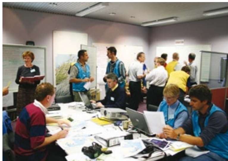
The incident command centre at Blenheim's Civil Defence Headquarters.

The National Response Team (NRT), the 'first-strike' team from Maritime NZ, local government and industry throughout the country charged with tackling a major spill, was then scrambled and began to arrive at Incident Command Centres (ICC) set up in Wellington and Blenheim.