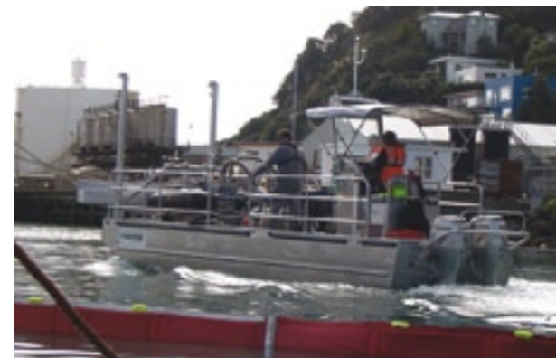
Oil recovery vessel Kuaka in Wellington during the exercise.

"However one tries, exercises can't simulate real life in full. If you don't want 'to play', it's easy to say that the exercise scenario is silly, state things like "we wouldn't respond like that in the real thing", or just refuse to engage but I saw none of this behaviour.