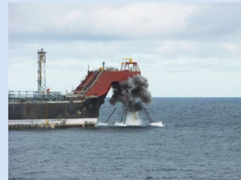
The achors blowing on the FPSO Whakaaropai.

On the morning of the 18th of May after successful trials, BW Endeavour sailed out into the Tasman Sea en route to Auckland to load bunkers before its voyage to Singapore.