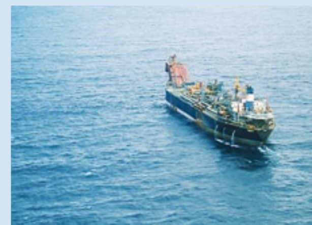
View from the helicopter as the FPSO heads out into the Tasman.

Once freed on 17th May, the FPSO now renamed BW Endeavour , was towed clear of Maui B platform by offshore supply vessel Pacific Chieftain .