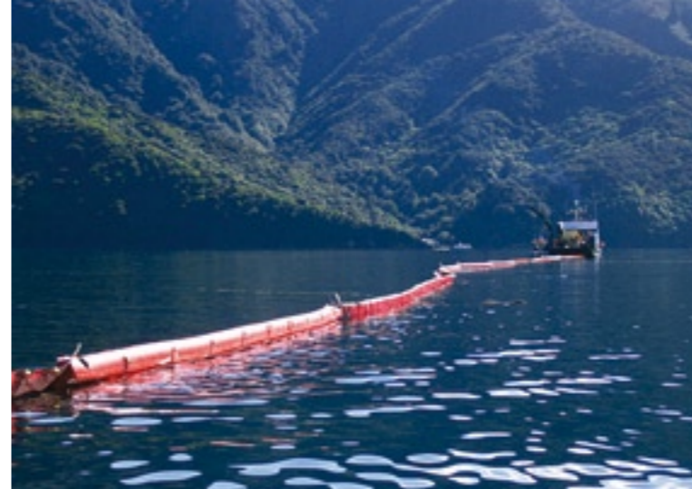
A barge lays sections of containment boom in Ruakaka Bay.

Much of the first day's OSR was taken up by information gathering and planning as international experience has proved that rushing people and equipment into a spill site can prove more damaging than the oil itself.