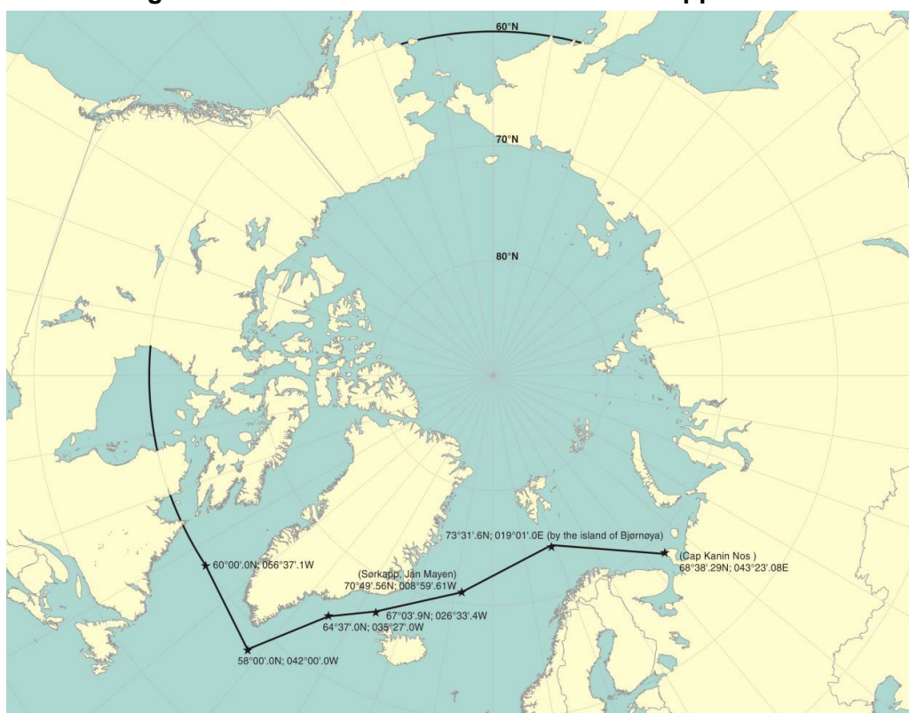
Figure 2 – Maximum extent of Arctic waters application